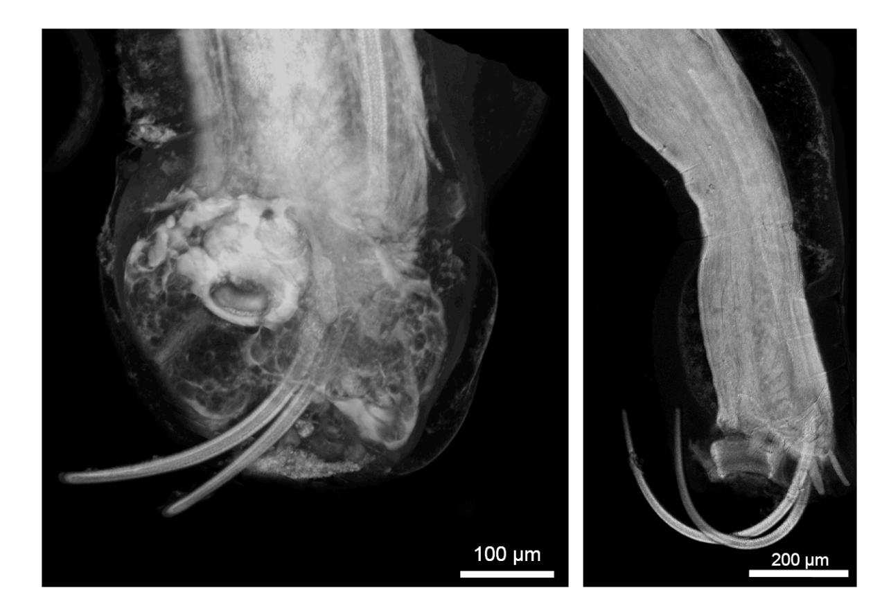
Figure 2. CLSM of Strongyluris brevicaudata , caudal parts of male.